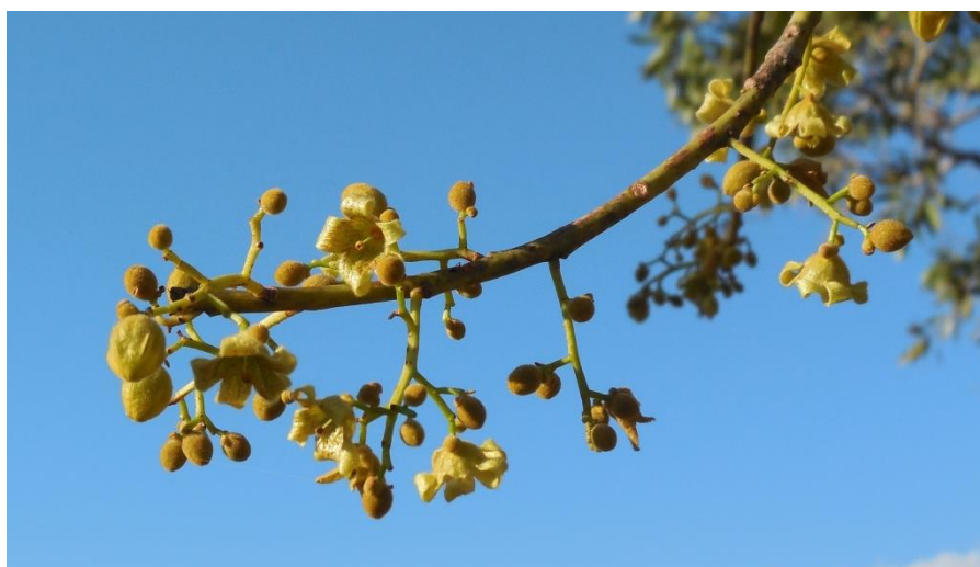
Brachychiton diversifolius at Douglas Daly.